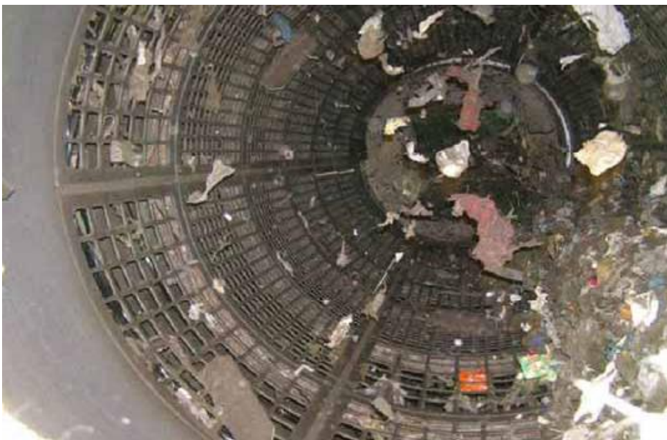
Figure 2: Waste separation using a trommel screen